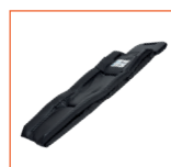
Anatomic Mattress with Children Restraint System