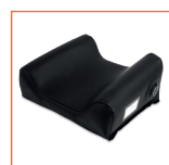
Sealed Anatomic Pillow