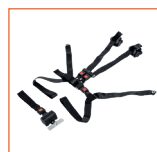
Automatic Patient Restraints