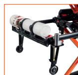
Oxygen Cylinder Holder, Head-End