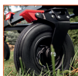
200 mm Transport Wheels