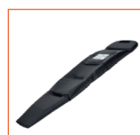
Mattress ECO with Children Restraint System