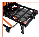
Storage Net Head-End