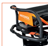
Push/Pull Bar, Foot-End