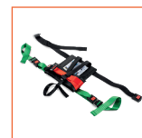
Removable Children Restraint System