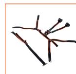
Hygiene+ Automatic Patient Restraints