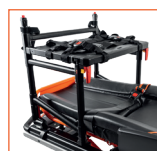
PacRac™+ Equipment Mount