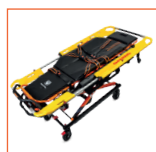
Split Scoop Extender Kit